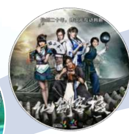
Sword and Fairy: the Tavern