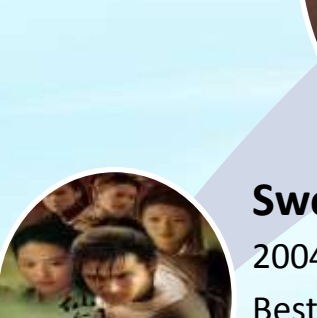
Sword and Fairy

On Dragon TV & IQiYi platform Over 1.3 billion click rate in 2 months